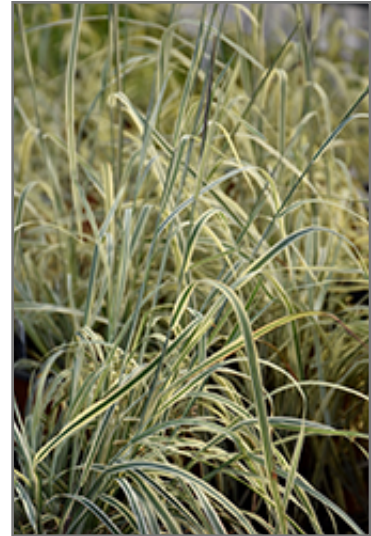
Shining Star Bluestem foliage

Shining Star Bluestem is recommended for the following landscape applications;