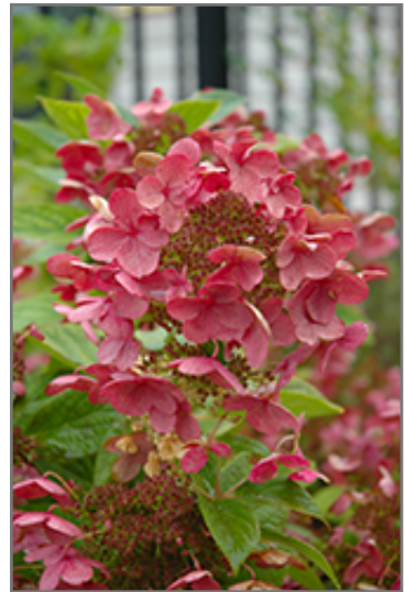
Quick Fire Hydrangea flowers (faded)

This shrub performs well in both full sun and full shade. It prefers to grow in average to moist conditions, and shouldn't be allowed to dry out. It is not particular as to soil type or pH. It is highly tolerant of urban pollution and will even thrive in inner city environments. Consider applying a thick mulch around the root zone in winter to protect it in exposed locations or colder microclimates. This is a selected variety of a species not originally from North America.