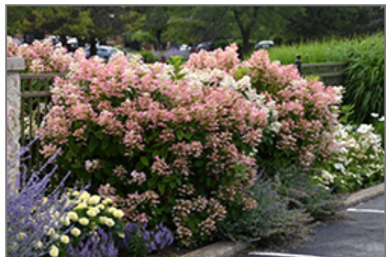
Quick Fire Hydrangea in bloom