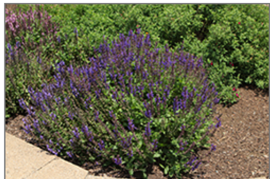
Noble Knight Sage in bloom