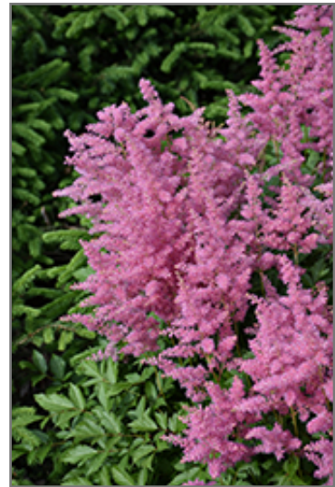
Visions in Pink Chinese Astilbe flowers

Visions in Pink Chinese Astilbe is recommended for the following landscape applications;