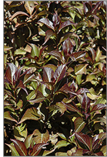
Dark Horse Weigela foliage

Dark Horse Weigela makes a fine choice for the outdoor landscape, but it is also well-suited for use in outdoor pots and containers. Because of its height, it is often used as a 'thriller' in the 'spiller-thriller-filler' container combination; plant it near the center of the pot, surrounded by smaller plants and those that spill over the edges. It is even sizeable enough that it can be grown alone in a suitable container. Note that when grown in a container, it may not perform exactly as indicated on the tag - this is to be expected. Also note that when growing plants in outdoor containers and baskets, they may require more frequent waterings than they would in the yard or garden. Be aware that in our climate, most plants cannot be expected to survive the winter if left in containers outdoors, and this plant is no exception. Contact our experts for more information on how to protect it over the winter months.