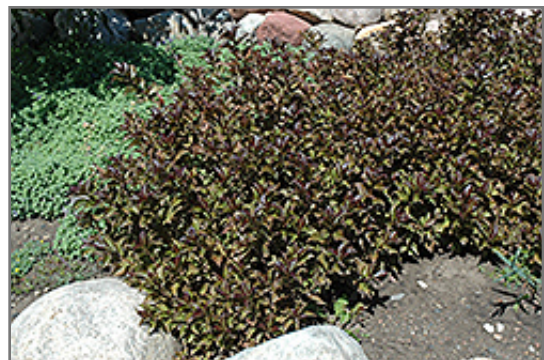
Dark Horse Weigela