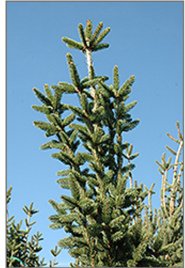
Columnar Norway Spruce foliage