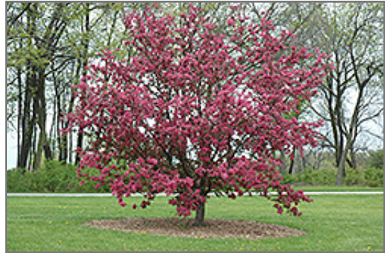
Purple Prince Flowering Crab in bloom

This tree will require occasional maintenance and upkeep, and is best pruned in late winter once the threat of extreme cold has passed. It is a good choice for attracting birds to your yard. It has no significant negative characteristics.