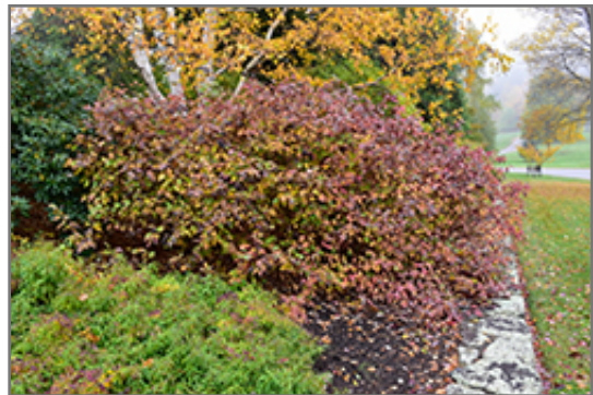
Bailey Red-Twig Dogwood in fall