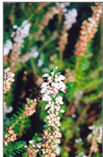
Scotch Heather flowers