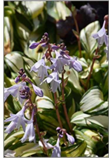
Rainbow's End Hosta flowers

Rainbow's End Hosta will grow to be only 6 inches tall at maturity extending to 10 inches tall with the flowers, with a spread of 24 inches. When grown in masses or used as a bedding plant, individual plants should be spaced approximately 20 inches apart. Its foliage tends to remain low and dense right to the ground. It grows at a slow rate, and under ideal conditions can be expected to live for approximately 10 years. As an herbaceous perennial, this plant will usually die back to the crown each winter, and will regrow from the base each spring. Be careful not to disturb the crown in late winter when it may not be readily seen!