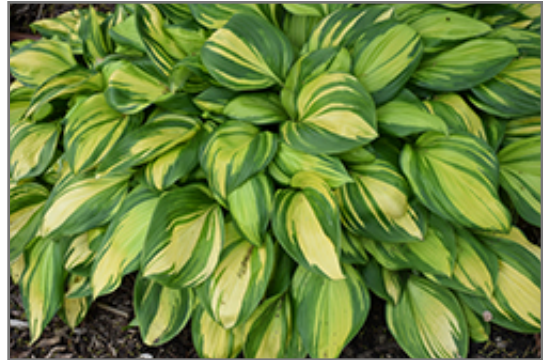
Rainbow's End Hosta