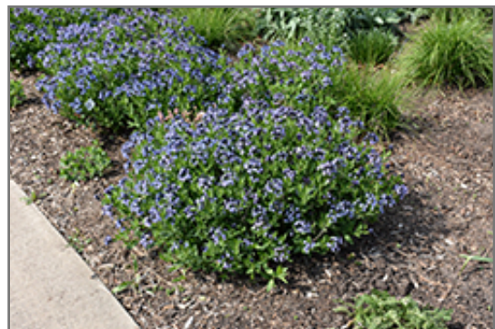
Blue Ice Star Flower in bloom