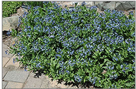
Blue Ice Star Flower in bloom

This plant does best in full sun to partial shade. It prefers to grow in average to moist conditions, and shouldn't be allowed to dry out. It is not particular as to soil type or pH. It is quite intolerant of urban pollution, therefore inner city or urban streetside plantings are best avoided. This is a selection of a native North American species. It can be propagated by cuttings; however, as a cultivated variety, be aware that it may be subject to certain restrictions or prohibitions on propagation.