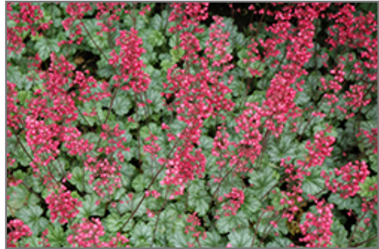
Paris Coral Bells in bloom

Paris Coral Bells will grow to be about 8 inches tall at maturity extending to 14 inches tall with the flowers, with a spread of 14 inches. When grown in masses or used as a bedding plant, individual plants should be spaced approximately 12 inches apart. Its foliage tends to remain low and dense right to the ground. It grows at a medium rate, and under ideal conditions can be expected to live for approximately 10 years. As an evergreen perennial, this plant will typically keep its form and foliage year-round.