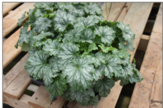
Paris Coral Bells foliage