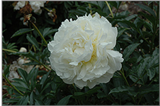
Marie Lemoine Peony flowers