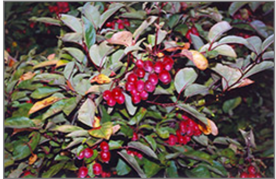
Adams Flowering Crab fruit

This tree should only be grown in full sunlight. It prefers to grow in average to moist conditions, and shouldn't be allowed to dry out. It is not particular as to soil type or pH. It is highly tolerant of urban pollution and will even thrive in inner city environments. This particular variety is an interspecific hybrid.