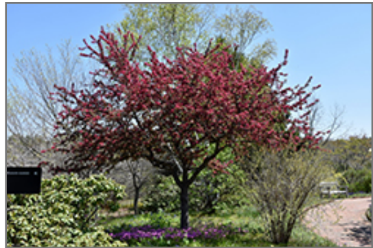
Adams Flowering Crab in bloom

Adams Flowering Crab is recommended for the following landscape applications;